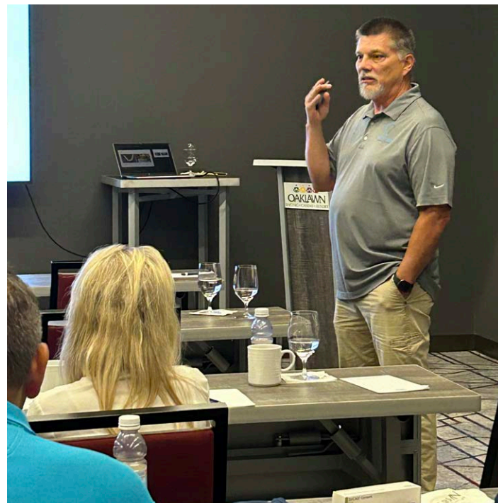
Jacksons Porcelain Lab