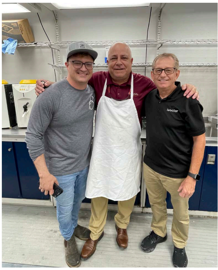
Barksdale Dental Lab