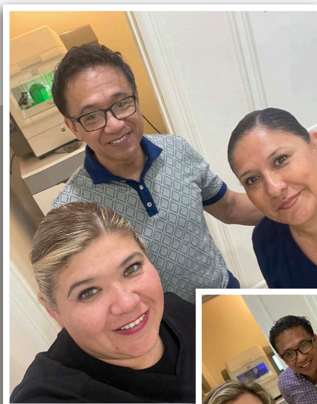
Pro Dental Lab