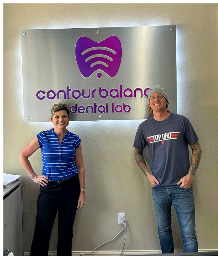
Contour Balance Dental Lab